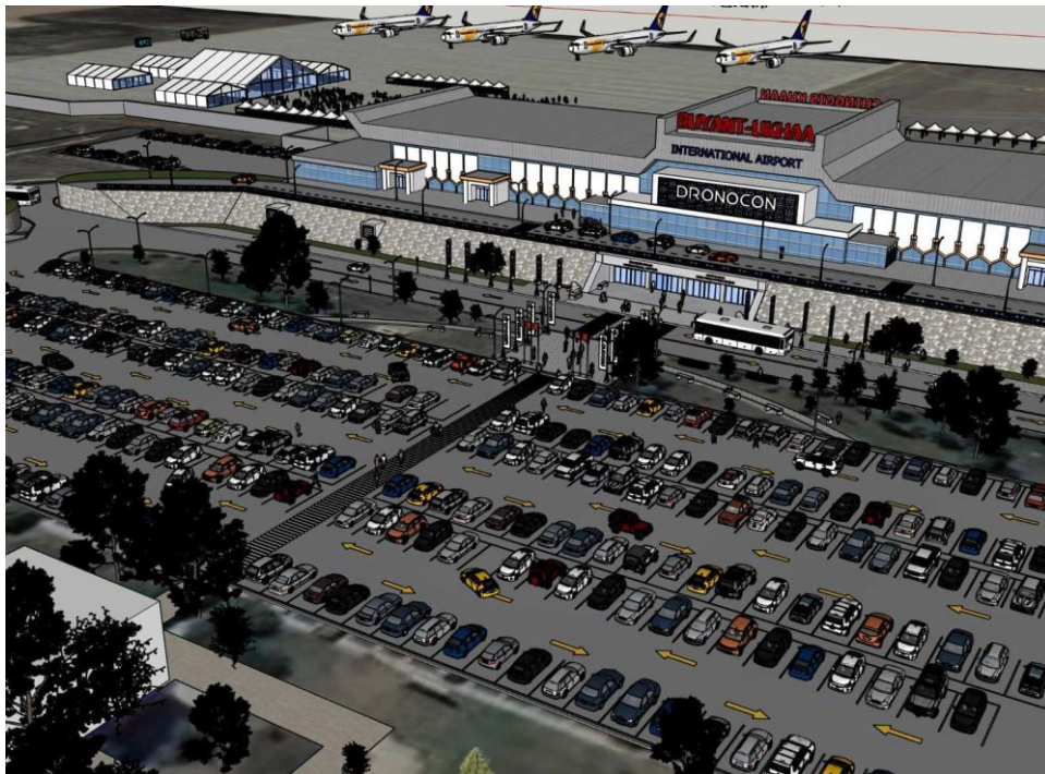
Buyant-Ukhaa International Airport