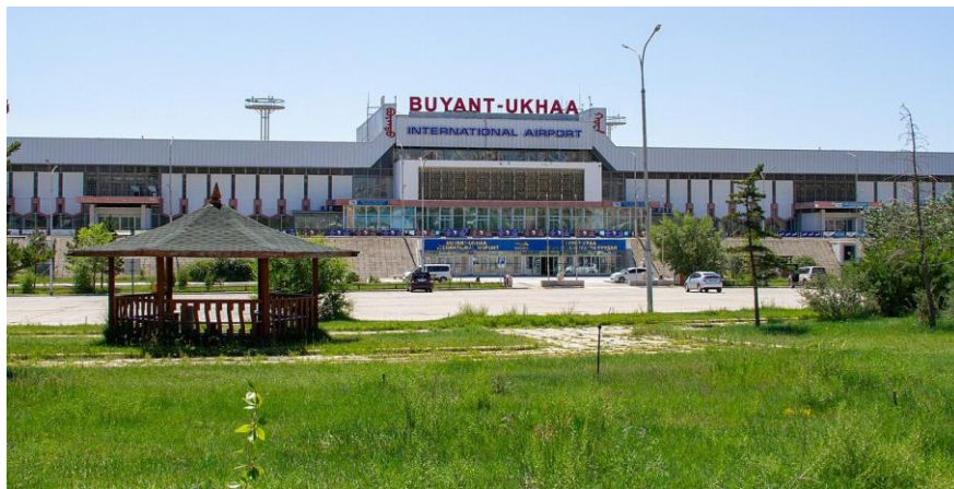
Buyant-Ukhoo International Airport Khan-Uul District Ulaanbaatar, Mongolia

Ulaanbaatar is the capital and largest city of Mongolia, serving as the country's political, economic, and technological center. The city is rapidly developing in the fields of innovation, digital transformation, and advanced technologies, making it an emerging destination for international technology-based events.